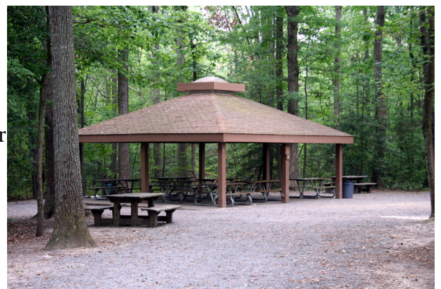
Gazebo at Dorey Park