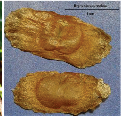
Left: Seed pod. Above: Individual seeds.

The related trumpet creeper ( Campsis radicans ) is similar, but climbs with ivylike aerial roots instead of tendrils and blooms later in the summer. Plant the two together, and you and the hummingbirds will have flame colored tubular flowers from which to feed from early spring and throughout the summer.