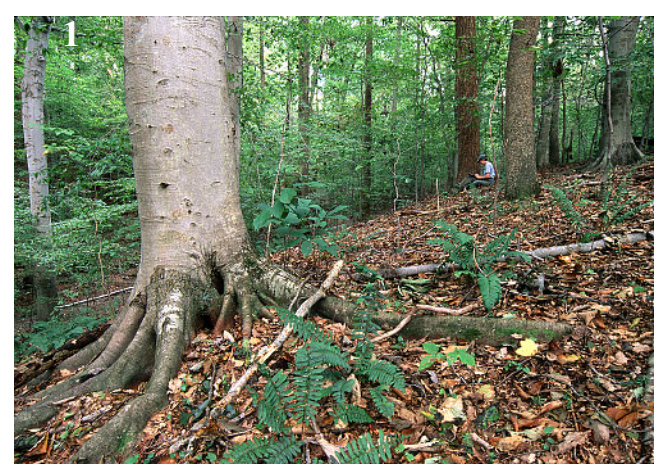
Christmas fern growing on a bank around a beech tree

Christmas Fern (Polystichum acrostichoides)